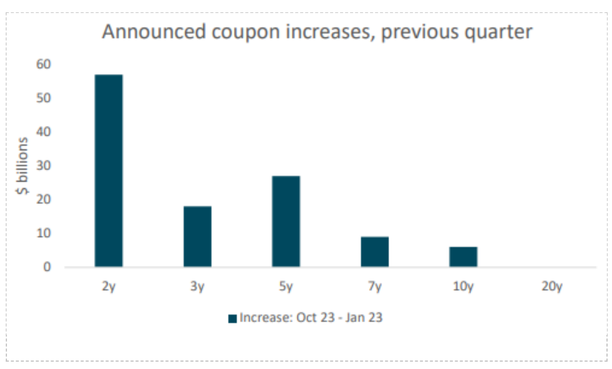
Coupon Supply To Become More Evenly Distributed?

We expect the proportion of bill issuance to be reduced, with more concentrated on coupons, as well as more even distribution of coupon issuance across the curve. While bonds rallied on the smaller-than-expected borrowing needs announced Monday, we are anticipating a more subdued – and perhaps opposite – reaction Wednesday morning.